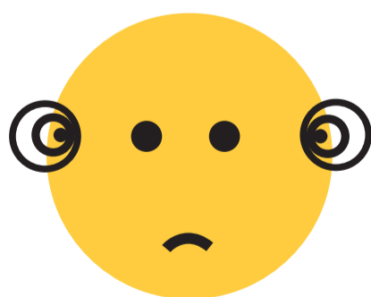
ringing in the ears