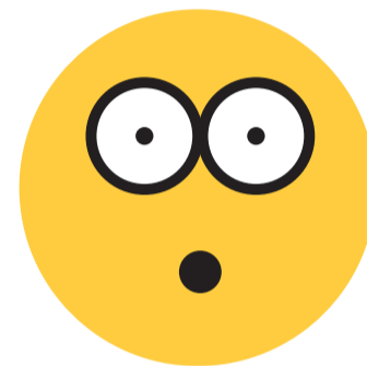
dazed or vacant stare