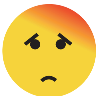
headache or dizziness