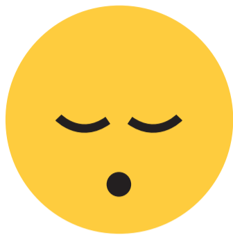
loss of consciousness