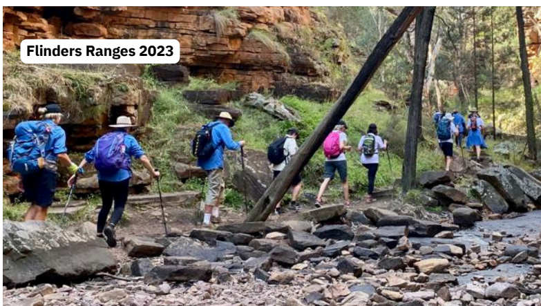
Flinders Ranges 2023